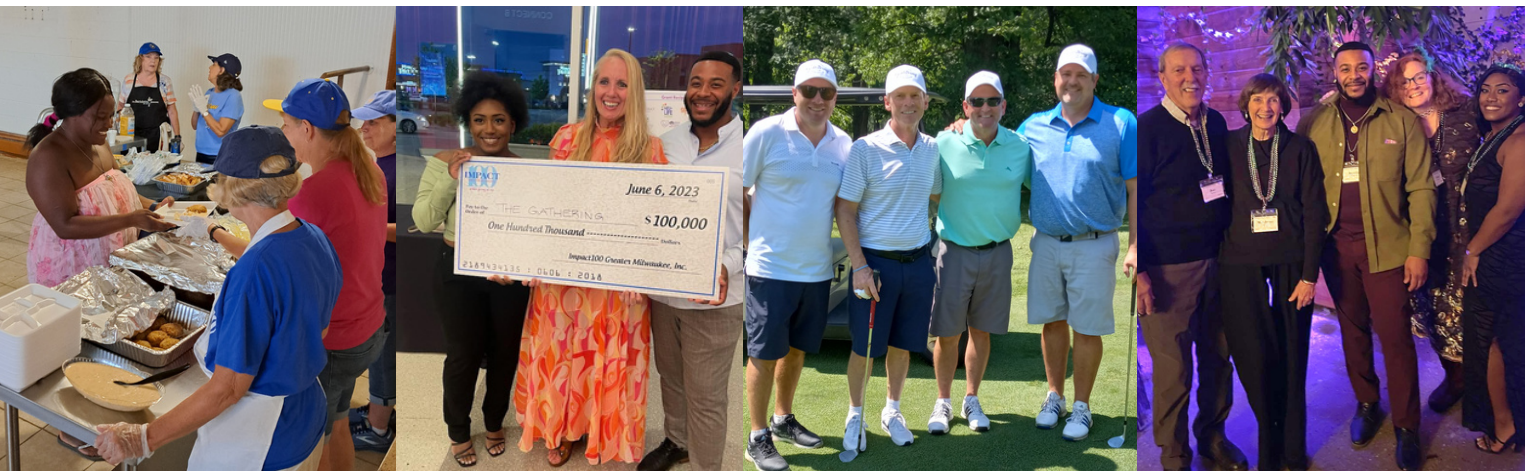
St. Paul 1st Day