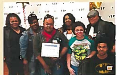
Volunteer Appreciation Event Awardees Serving Group: Ladies of the Circle