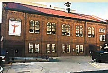
The Gathering on State Street Our new downtown site at St. Ben's Parish