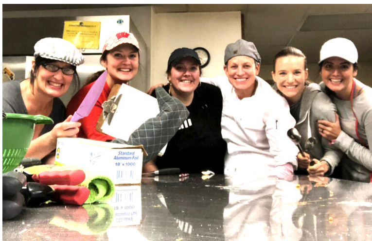
The Spice Girls, our newest Saturday Lunch Cook Team

“In community” means that whether guest, volunteer, donor, vendor, collaborator or staff you are known - often by name, almost always by face. You are trusted to play the role you play with kindness and compassion, and you trust The Gathering to do the same. We are invested in each other over the long haul through good times and difficult ones. Read this newsletter with the words “in community” in mind and you will begin to recognize this work more and more as a conversation and not a onetime event. Thank you for the part you play.