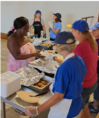
St. Paul 1st Day