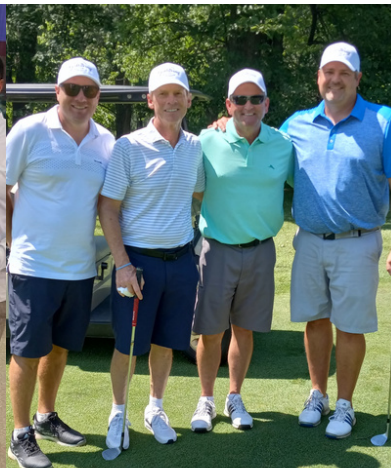
Sweet 16 Golf Classic