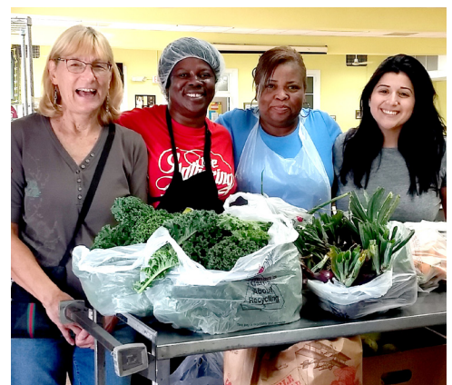
Produce Donation from Shepherd's Purse