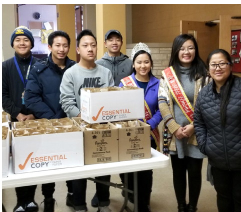
Bag lunches prepared and donated by Hmong Consortium