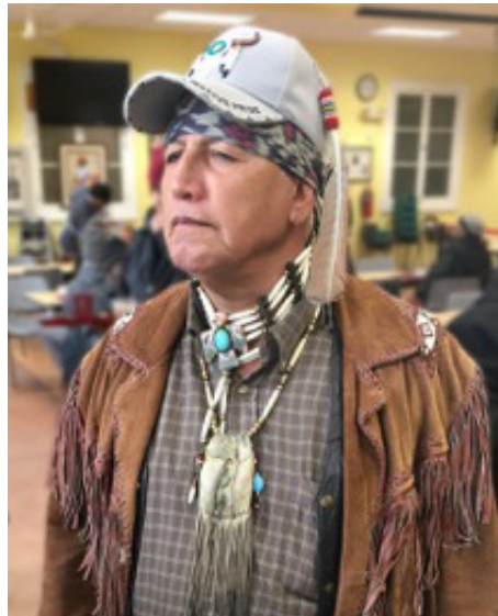
White Eagle - Gathering Guest