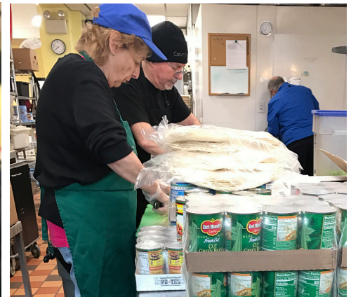
First Saturday Cooking Group